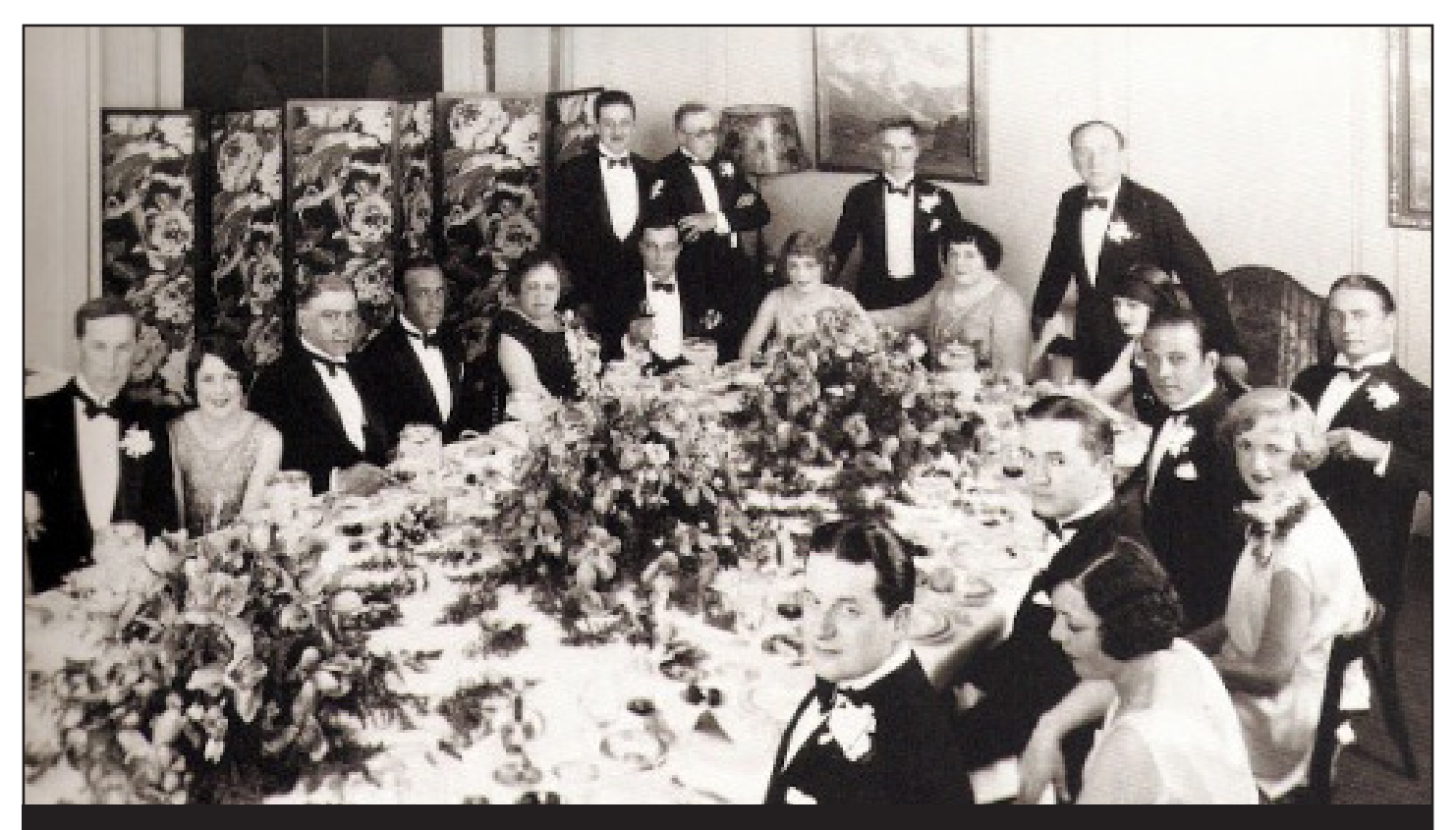
The 88th Annual Anniversary Dinner of the Society of Australian Cinema Pioneers will now be held on Wednesday 16th March, 2022 at 6.30pm for 7pm at the Swissotel, Market St, Sydney (opposite the State Theatre) Full booking details will be sent early next year.